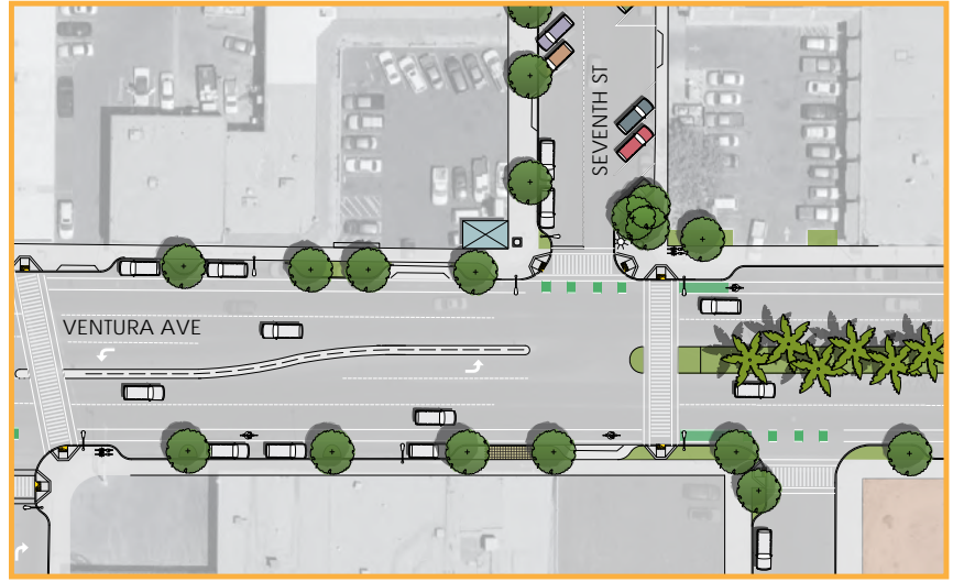
Draft Conceptual Design at Seventh St and Ventura Ave