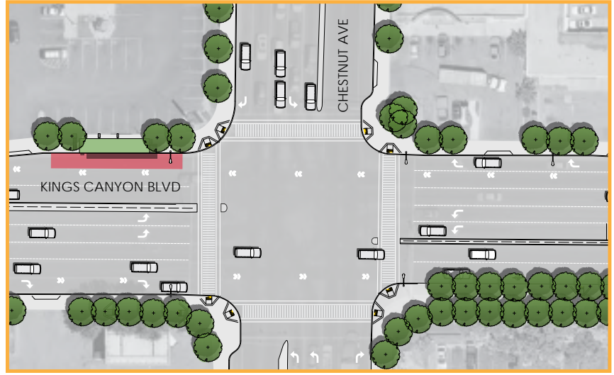
Draft Conceptual Design at Chestnut Ave and Kings Canyon Blvd

Please join us for the third and final community event of the project where we will be presenting the preferred conceptual design and aspects of the Draft Revitalize Ventura/Kings Canyon Plan.